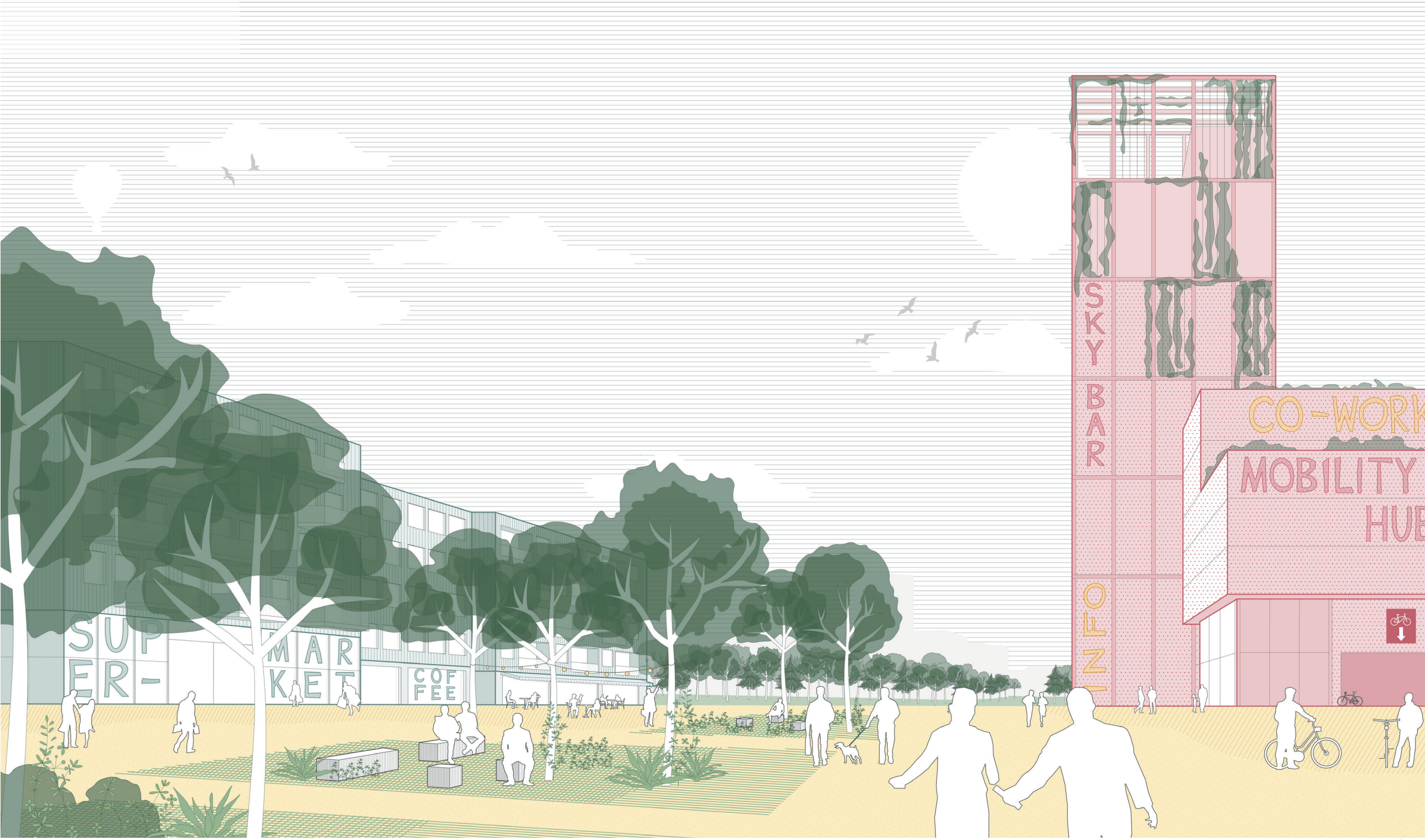
view of mobility hub and green passage

The "zam wachsn" (bavarian: growing together) design is based on a careful analysis of the existing environment. The aim is to allow both urban and landscape structure to develop harmoniously and grow together. In the course of six new neighborhoods, Wutzelhofen in the south is to be seamlessly connected with the Haslbach industrial estate in the north. The appearance of the buildings and the formal language are based on the existing structures. In addition, landscaped spaces to the west and east, which cut through the new development, are connected. It creates a horizontal landscape connection between Mühlberg and Brandlberg, which